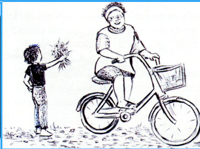
Regina Cohene, sm